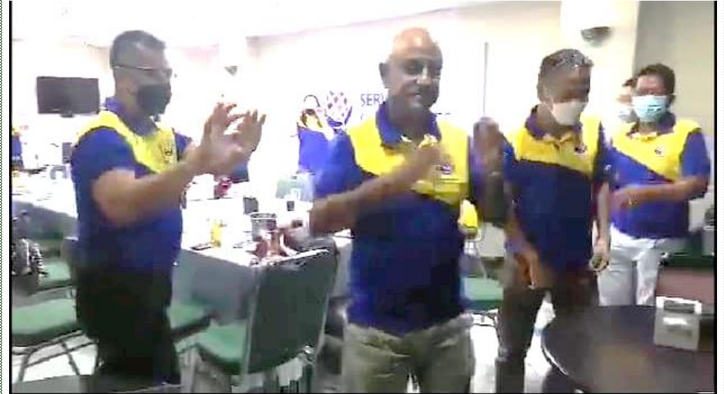
Area 2 Committee Meeting (ACOM) Roadway Inn. Nov. 12, 2021