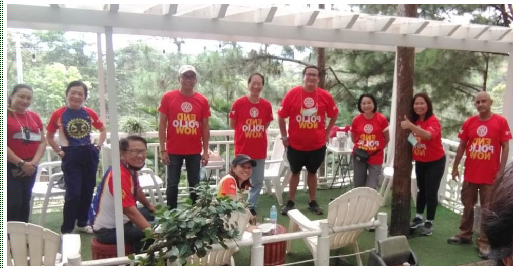
Lunch fellowship at Highway 81 after the turnover of projects.